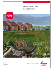
Leica Viva TS16