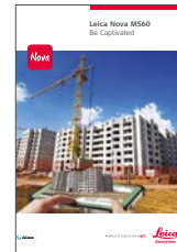
Leica Nova MS60